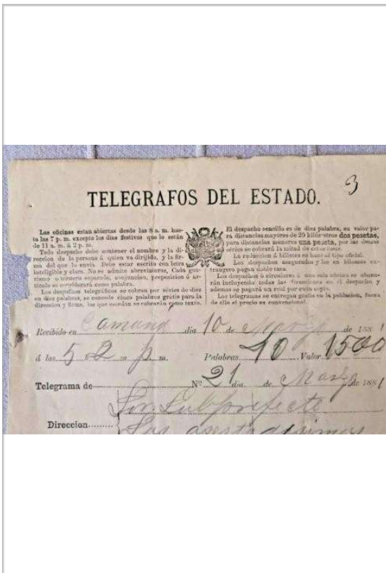
Image: Front View, upper detail.